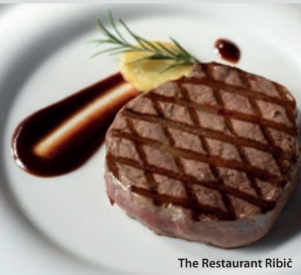
The Restaurant Ribič

The restaurants and cuisine of this area are an important part of the delightful tourist offer. Varied and imaginative dishes will delight even those with the most discerning palates, guaranteeing that you'll soon get the wish to return and taste them again. From the offer of traditional dishes cooked and served by our grandmothers to gourmet specialties - there's something to satisfy all tastes and wishes! Our recommendation goes to the following restaurants: "Ribič" and "Se-Mi" in Veliko Trgovišće, the Castle Mihanović and "Noć i Dan" in Tuheljske Toplice, or "Stara Vodenica" in Klanjec. Also, make sure not to miss out on the opportunity to sample some of the wine varieties of this region.