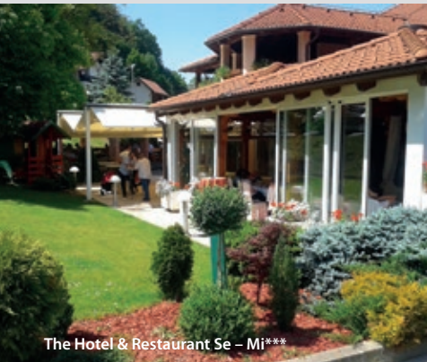
The Hotel & Restaurant Se – Mj***

Veliko Trgovišće, a lovely family-friendly place, was first mentioned in the early 16th century. Located at the entrance of the Krapina-Zagorje County from the direction of Zagreb, along the bank of the Krapina River, it is well connected to the capital of Croatia and other European centres. Throughout history, the town expanded and developed with the construction of the road and later with the construction of the railway. The oldest school in the Balkans of that time was founded right here, in the area of the church in Velika Erpenja! Veliko Trgovišće is the birthplace of the first Croatian president, Dr Franjo Tuđman.