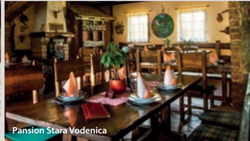
Pansion Stara Vodenica