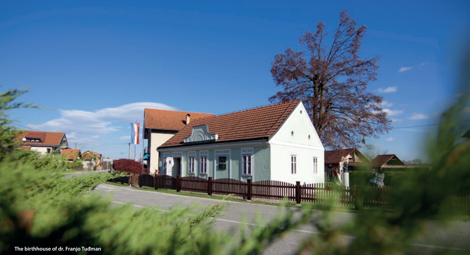
The birthhouse of dr. Franjo Tuđman