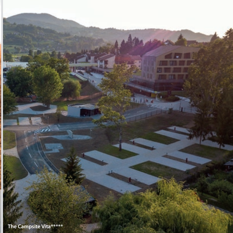
The Campsite Vita*****