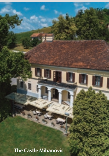
The Castle Mihanović