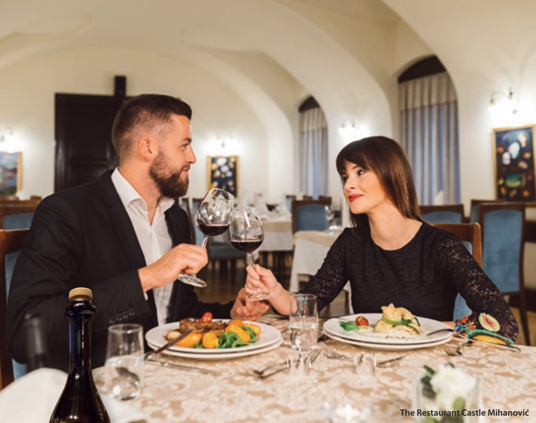
The Restaurant Castle Mihanović